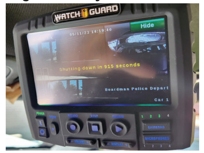
Dash Camera Inside BPD Patrol Car

The Boardman PD currently averages approximately 160 to 175 recordings every day.